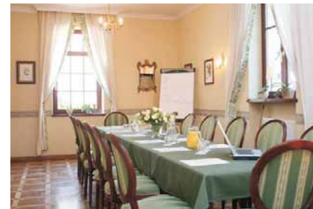
W orking Holidays