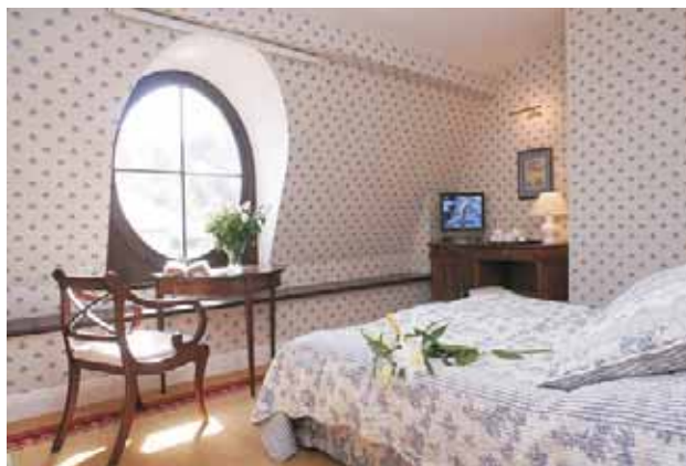
H otel and Restaurant booking