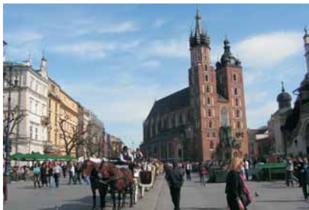
C ity Break - Kraków and nearby