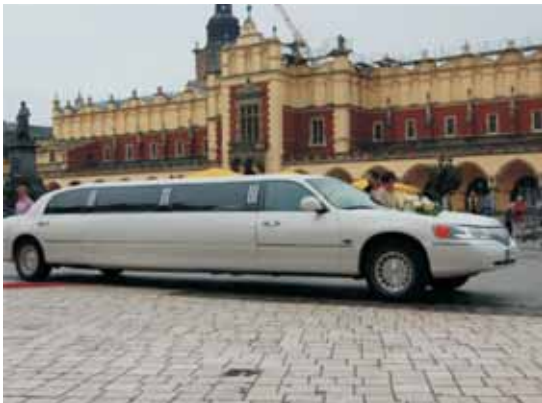
Limousin / old fashion car airport transfers