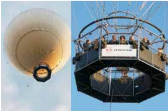
Baloon flight in the center of Krakow - Old Town view