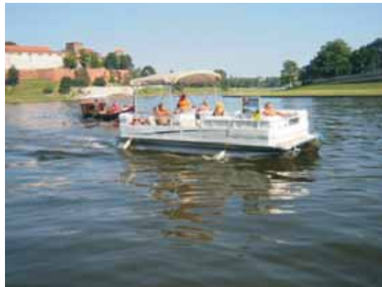
Vistula Cruise picnic