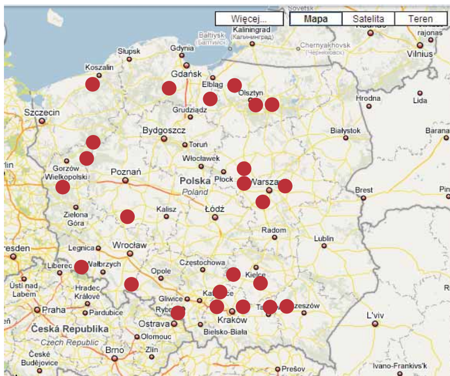
Locations of Historic Hotels Poland