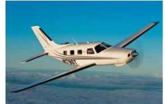
Plane flight (over Auschwitz or North Krakow)