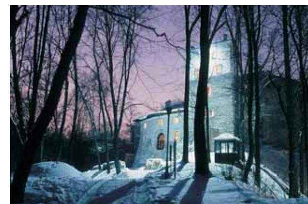
I n touch with history – Explore unique Poland