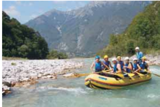
Pontoon rafting along Dunajec river